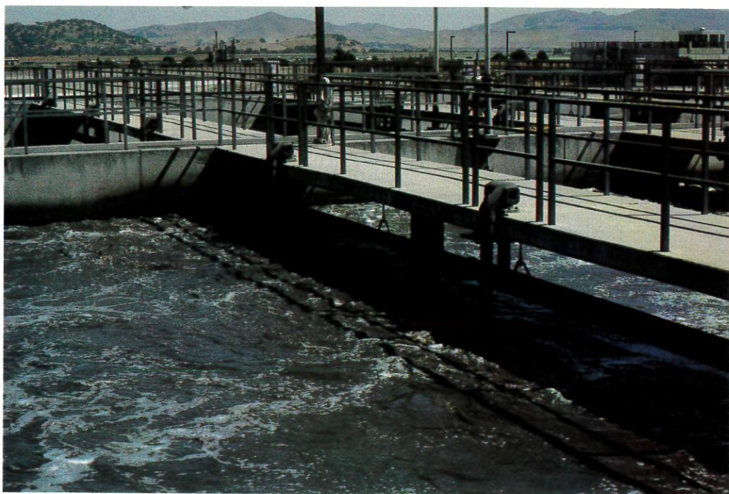
Activated sludge, secondary treatment of municipal wastewater.