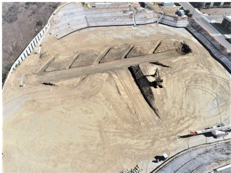
The North City Water Reclamation Plant is under construction with earth moving and site preparation. Seen here is an aerial shot looking westward onto the site. (Sept. 2021)