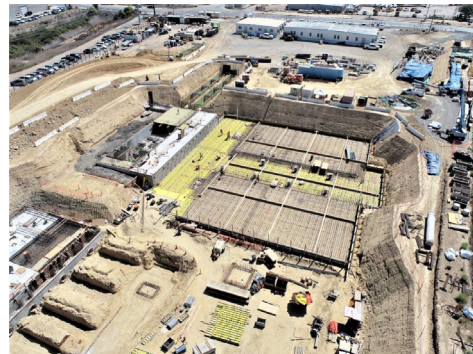
The North City Pure Water Facility project is making progress. This southwest aerial photo shows the foundation for the ozone building. (Sept. 2021)